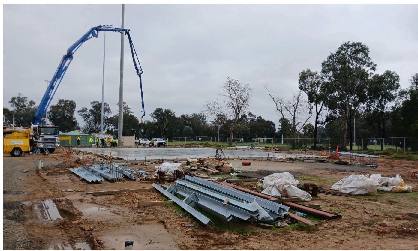
New Court No 5, concrete pour on 25th July 2023