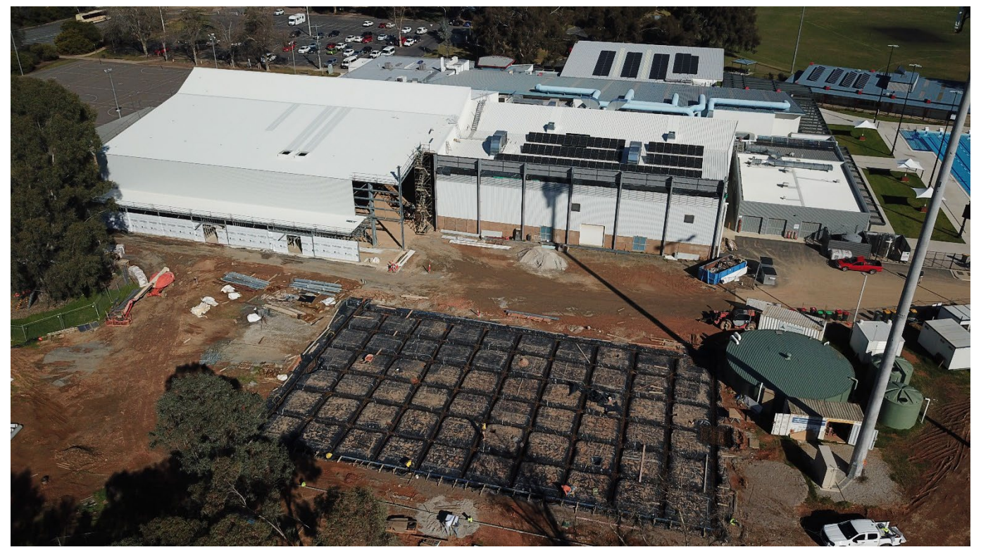
Show Court No 1 structure and Court No 5 footings prior to pouring of 243m³ of concrete.

Southern Cross Developers (SCD) are progressing well with the completion and opening of the Gym on 1st June, Show Court structure is nearing completion and 80% cladded. This week SCD completed the concrete footings and slab for court No 5 as well.