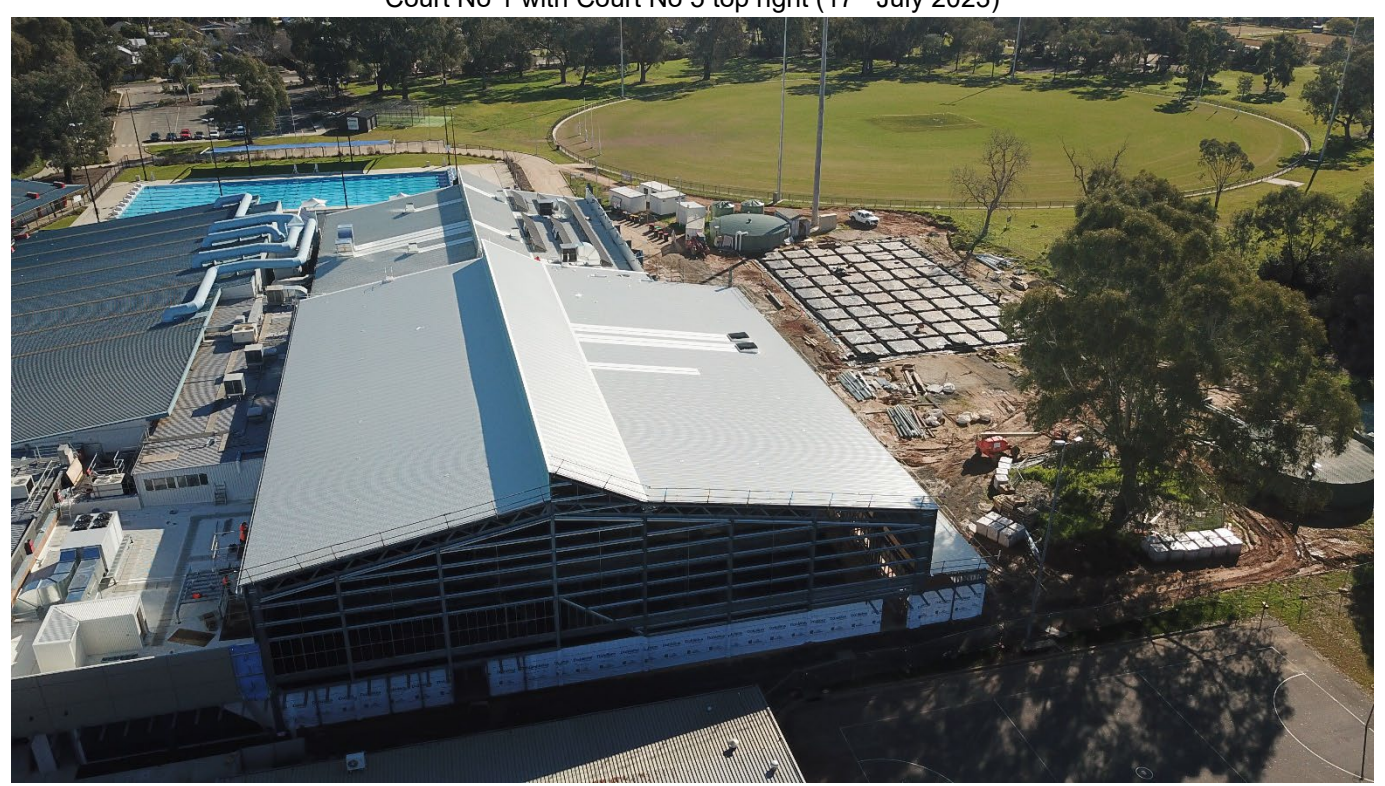
Court No 5 final finish (28th July 2023)

Court No 1 with Court No 5 top right (17th July 2023)