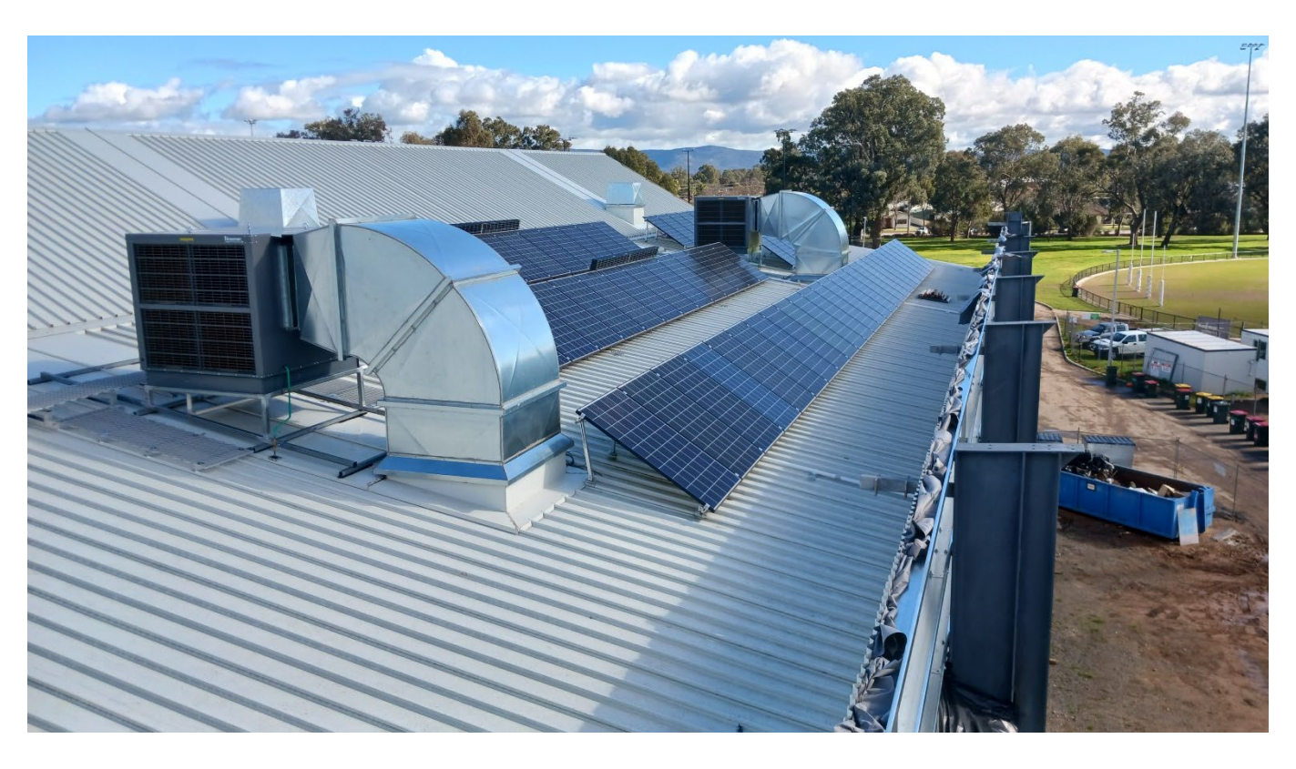
WSAC will have a total of 98 kW of solar panels feeding power into the facility.