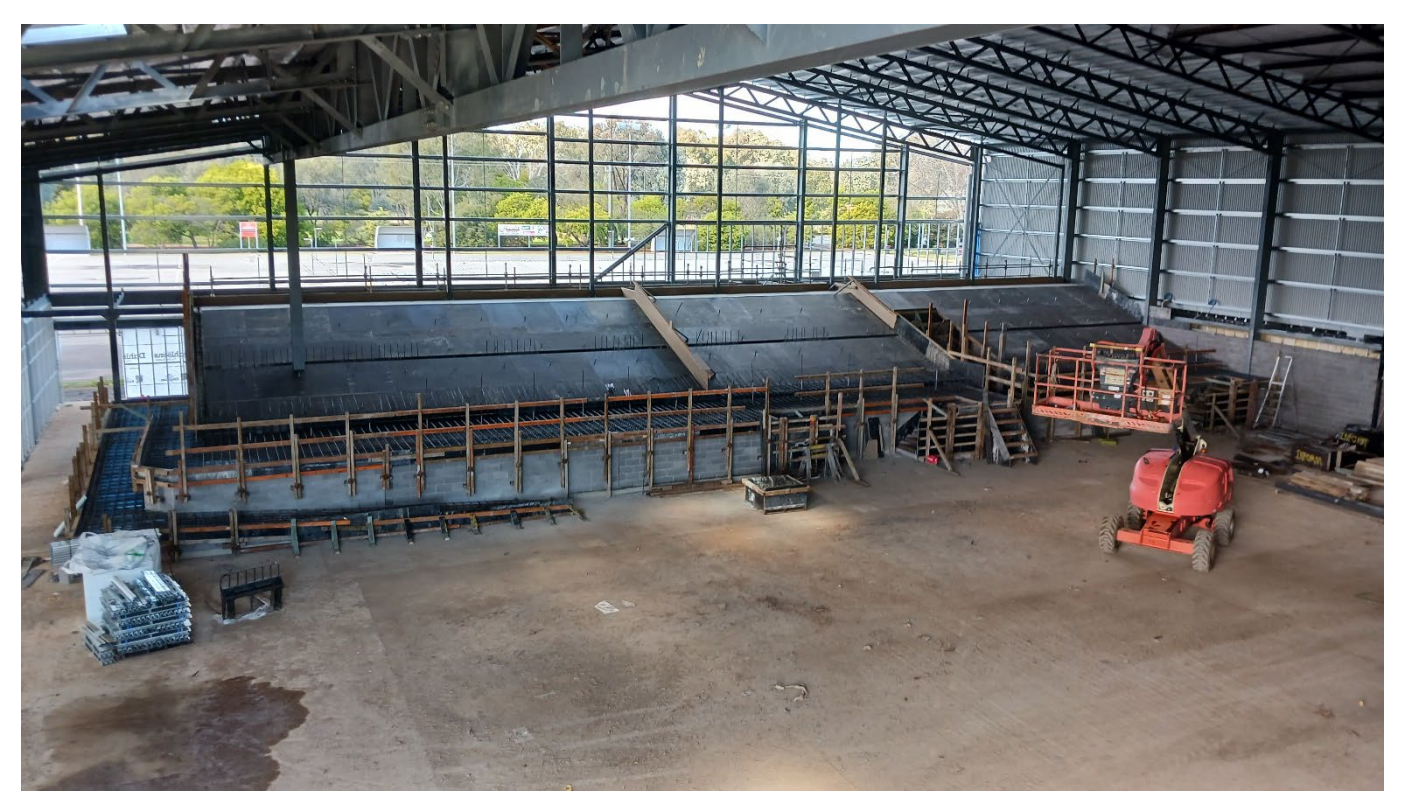
Show Court No 1. New East Grandstand formwork

With the completion of the Gym space, SCD are now focused on completing the under grandstand works and show court No 1.