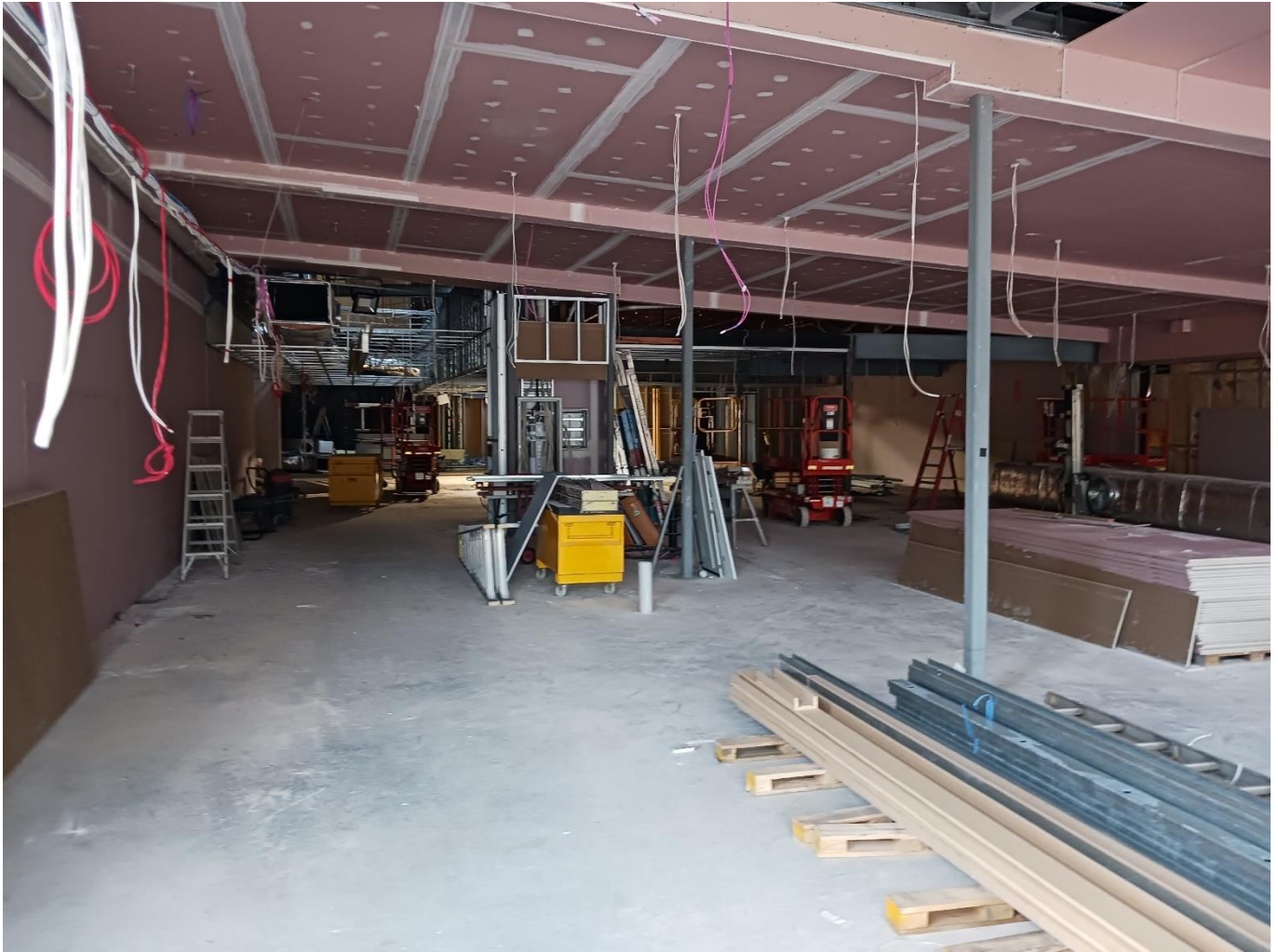
New Gym Plaster Installation

SCD are well underway with the construction of the new gym space with the completion of steel frame, the roofing walls, placement of the air conditioning system, and the rough-in of electrical, data and plumbing. This week will see the completion of the fire check plaster ceiling and walls, the electrician and mechanical contractors will then install the lighting and mechanical ductwork to the gym space.