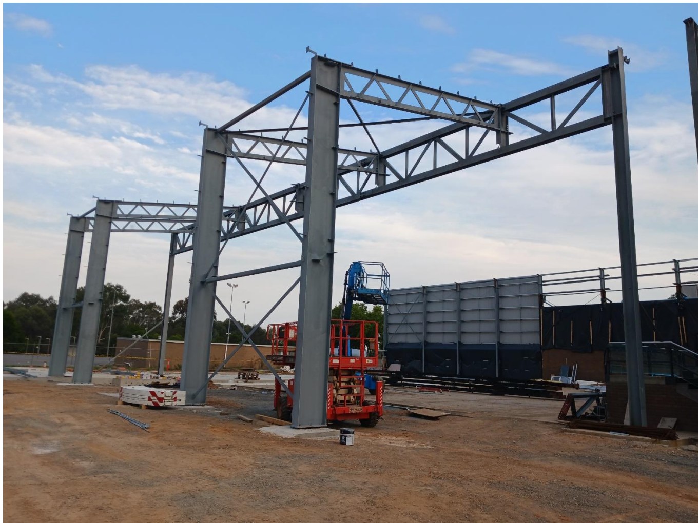
North Wall of Show court No 1.

SCD plumbing contractors are nearing completion of all the underground services such as sewer, water, fire, and civil drainage systems.