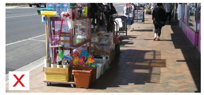
Goods must not be unsightly. manner