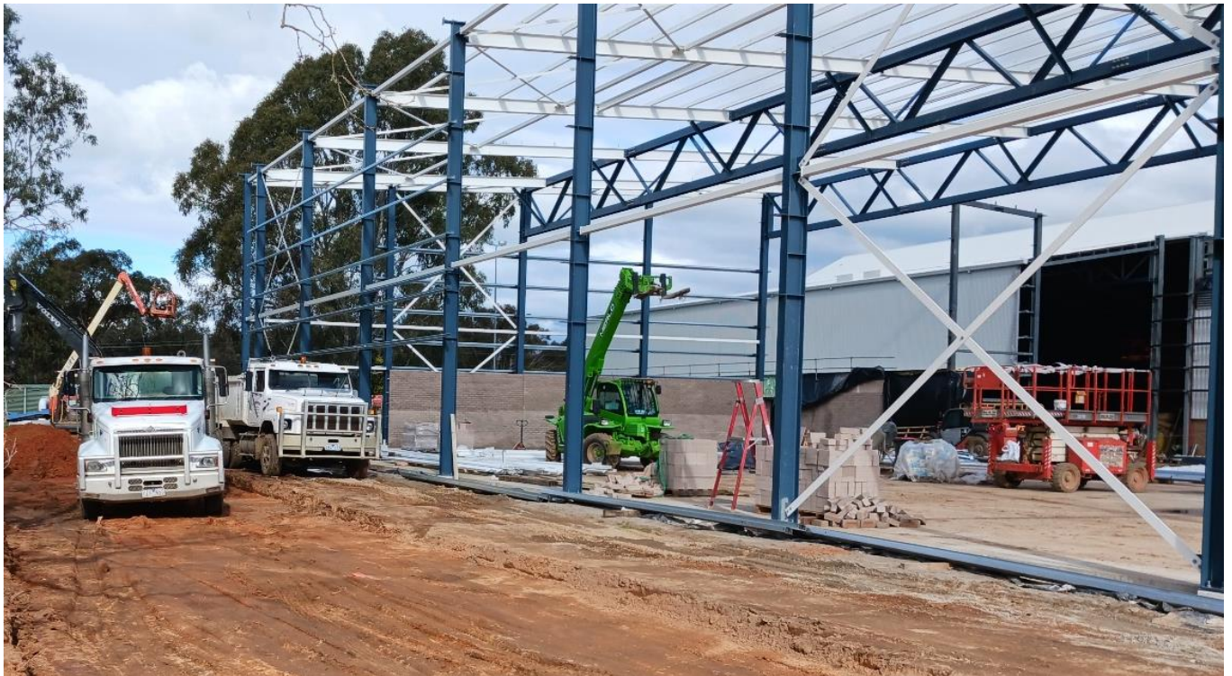
Emergency access road works (11 th September)