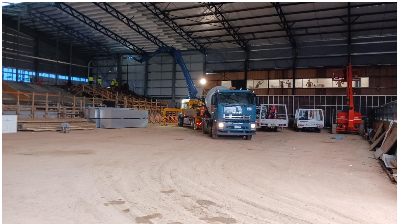
Show Court No 1. Concrete pour

This week, SCD will complete the second of three concrete pours of the new grandstand within Court No 1, the remaining and last concrete pour will follow shortly. Internal wall framing is now 80% complete and internal wall lining will commence shortly. Within the next few weeks, the concrete floor will be prepared for the timber sports floor. Internal plastering to the storeroom will be completed then painted and the floors will be prepped for new floorcoverings.