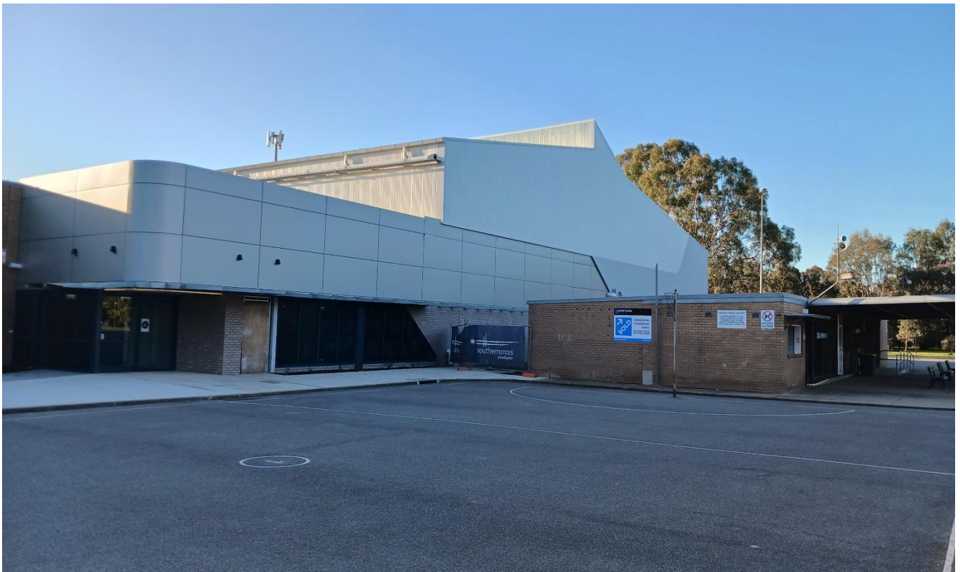
Eastern Elevation of Gym and Show Court No 1.