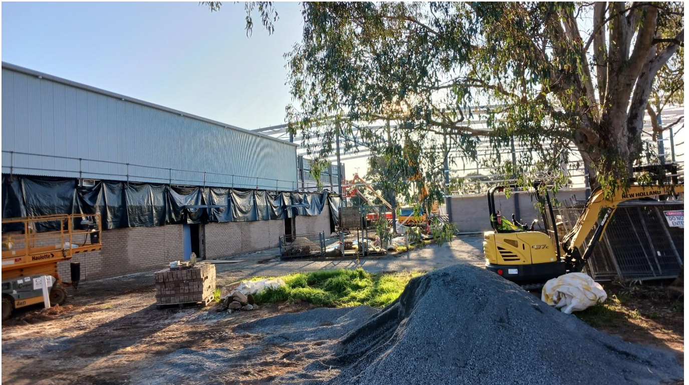
Show Court No 1 (5 th September)