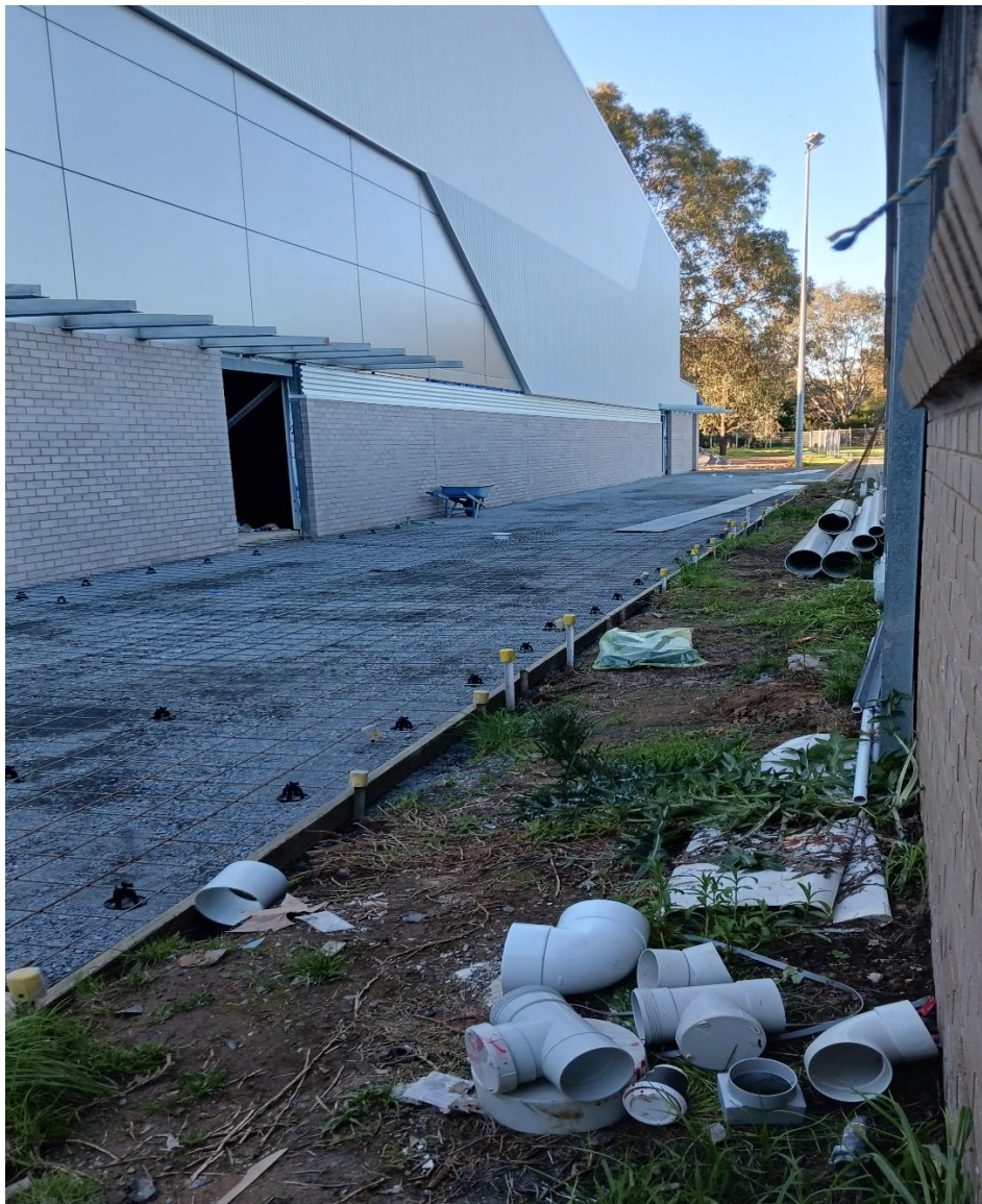
Concrete Pathway prepared for concrete (11 th September)

Newsletters will be sent out on a regular basis throughout the construction phase of the project, or as required.