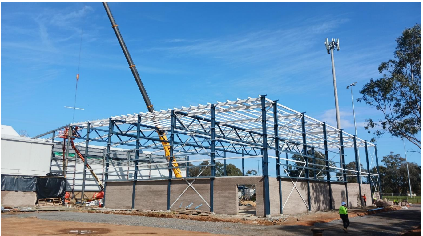
New Courts 4 & 5 steel structure (11 th September)

Southern Cross Developers (SCD) are progressing well with courts 4 & 5 steel structure is nearing completion, roof cladded will commence installation within the next two week. This week SCD also completed the all the external cladding of Show Court No 1 along with plastering and brickwork to the storage areas. Next Tuesday the second and largest concrete pour will take place on the new grandstand with only one smaller section to be completed within three weeks.