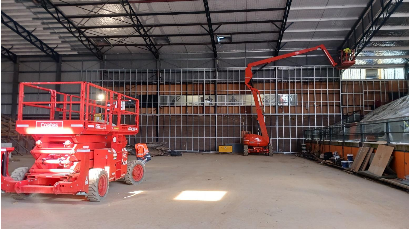
Show Court No1 wall framing installation and steel frame painting (11 th September)