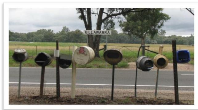
Killawarra sign and many varied post boxes

Some residents of Killawarra approached Wangaratta Rural City Council identifying themselves as a community that would benefit from developing a community plan. After several informal meetings a small group of enthusiastic residents with support from Council planned and hosted the Killawarra Community Planning Meeting. All residents were invited to attend on Sunday 10 April 2011 to start a discussion about their priority needs and aspirations for Killawarra's future development. A follow up workshop to further scope the identified needs into actions was held on Monday 16 May 2011 at Granite Gardens. The information captured at these gatherings forms the base for the Killawarra Community Plan.