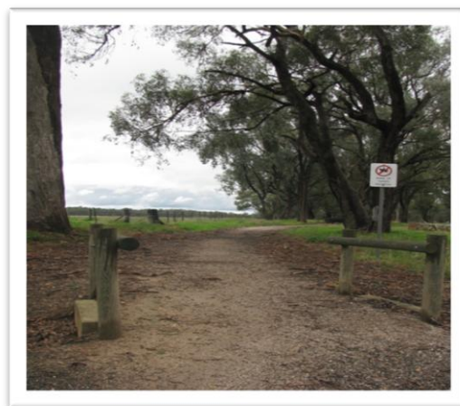
Bike track to Wangaratta