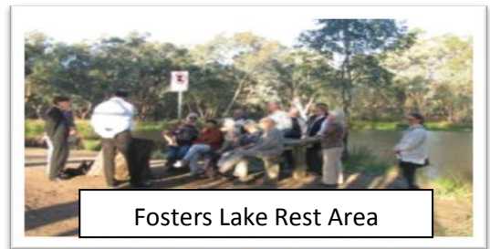
Fosters Lake Rest Area