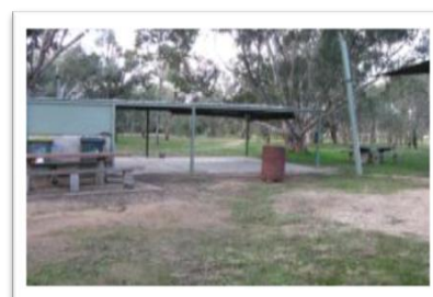
Hamilton Park BBQ Area