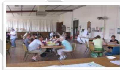
Initial community meeting