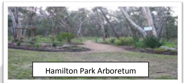
Hamilton Park Arboretum