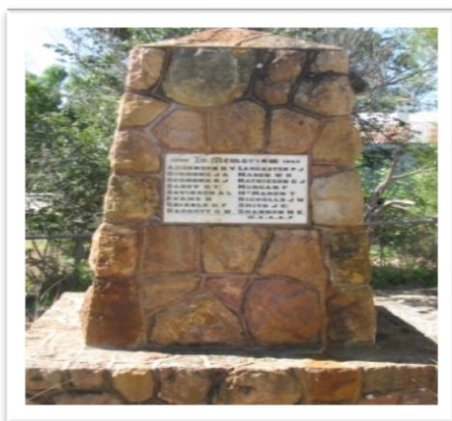
El Dorado Cenotaph located at front of Hall

El Dorado Memorial Hall El Dorado Cenotaph Monument Hill