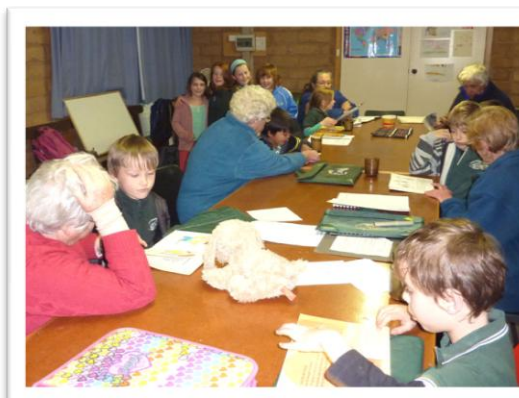
El Dorado Homework Group

Skate park public swimming pool Netball & football practice nets Art & craft more shops Jumping castle motorbike track Zoo drive in Gymnastics goal posts Scouts big swing Paint ball